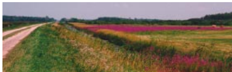
Libau release site - July 1994

A second example comes from a site in the Libau-Netley Marsh. In 1994, 1000 G. californiensis were released and by 1998 no flowering purple loosestrife plants were found.