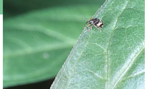
Adult Nanophyes marmoratus

In 1996, the Manitoba Purple Loosestrife Project was a partner in a collaborative effort with Cornell University and the Minnesota Department of Natural Resources. The team collected N. marmoratus from its native European range. Collected N. marmoratus were taken to the University of Kiel in northern Germany for nematode screening. After screening, insects were then imported into North America and held in quarantine at Cornell University until the spring of 1997. Voucher specimens can be found in the Canadian National Collection of Insects in Ottawa.