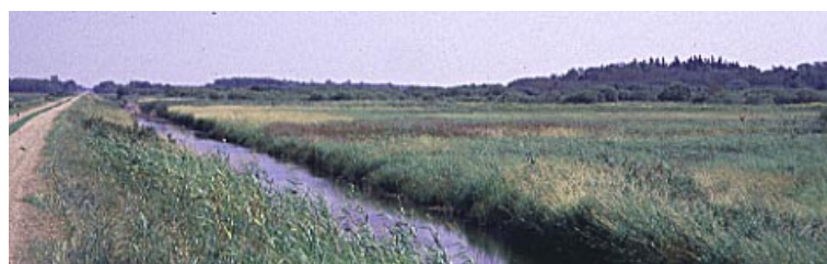
No Flowering Loosestrife - July 1998