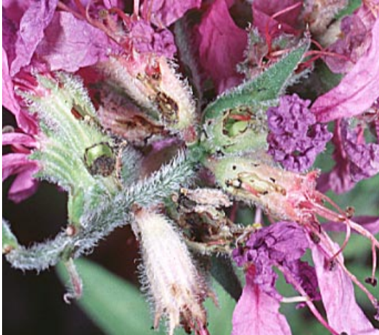
Exit holes in seed capules indicate presence of N. marmoratus .