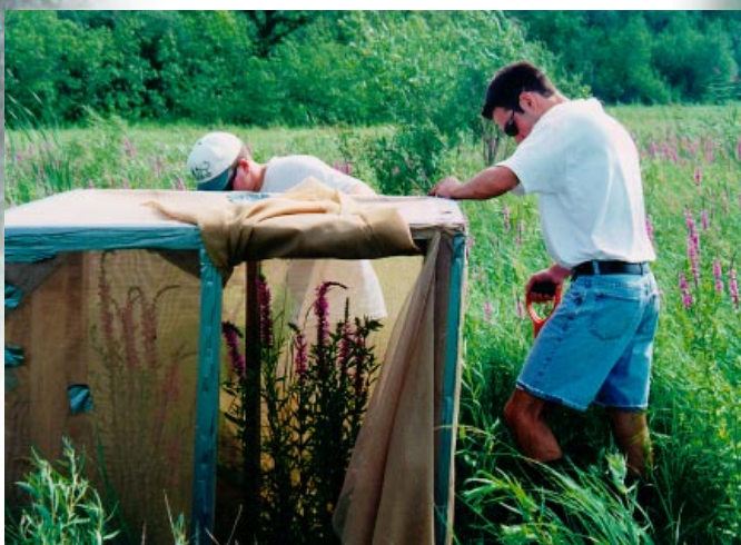
Researchers release N. marmoratus into a field cage.

The expected results will lead to the restoration of natural floral diversity in areas infested with purple loosestrife.